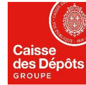
Caisse des Depots