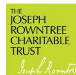
Joseph Rowntree Charitable Trust