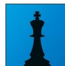
LA FINANCIERE DE L'ECHQUIER