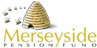
Merseyside Pension Fund